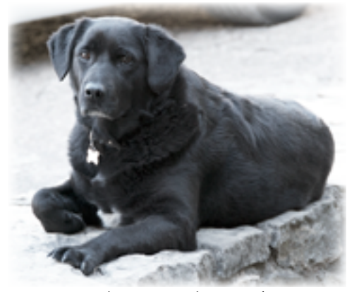
Baylee (not our dog) says hi!

Please consider including Cloudhaven in your end-of-year giving. Your donations are taxdeductible and allow us to continue ministering to the folks that God sends here.