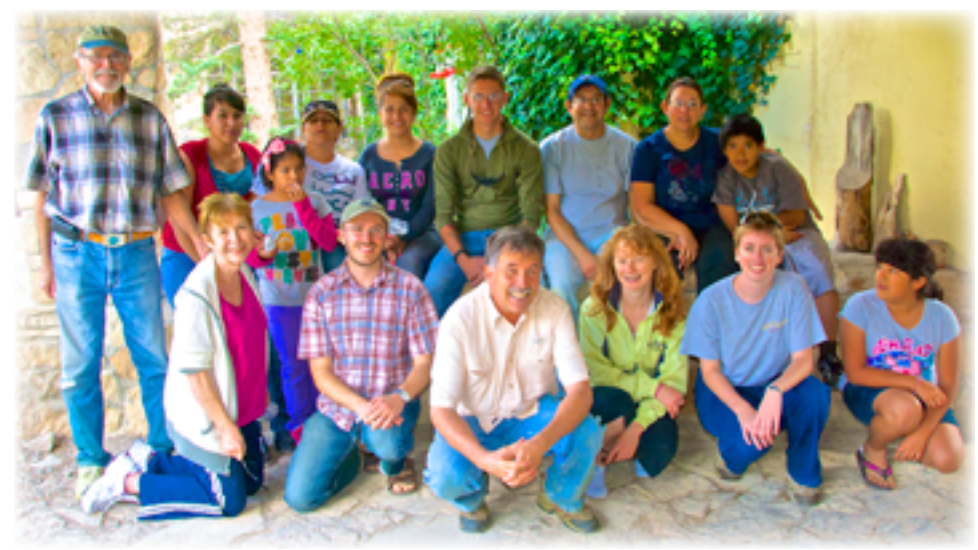
The crew from Las Tierras and Christ the King