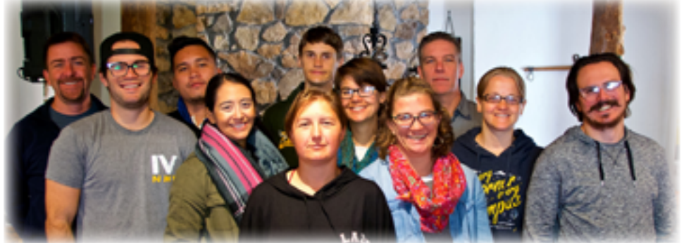
Intersivity Christian Fellowship—our last large group?