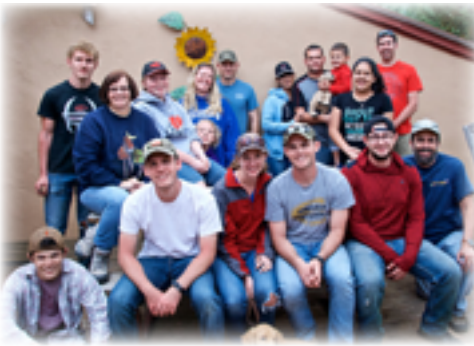
Las Tierras Community Church